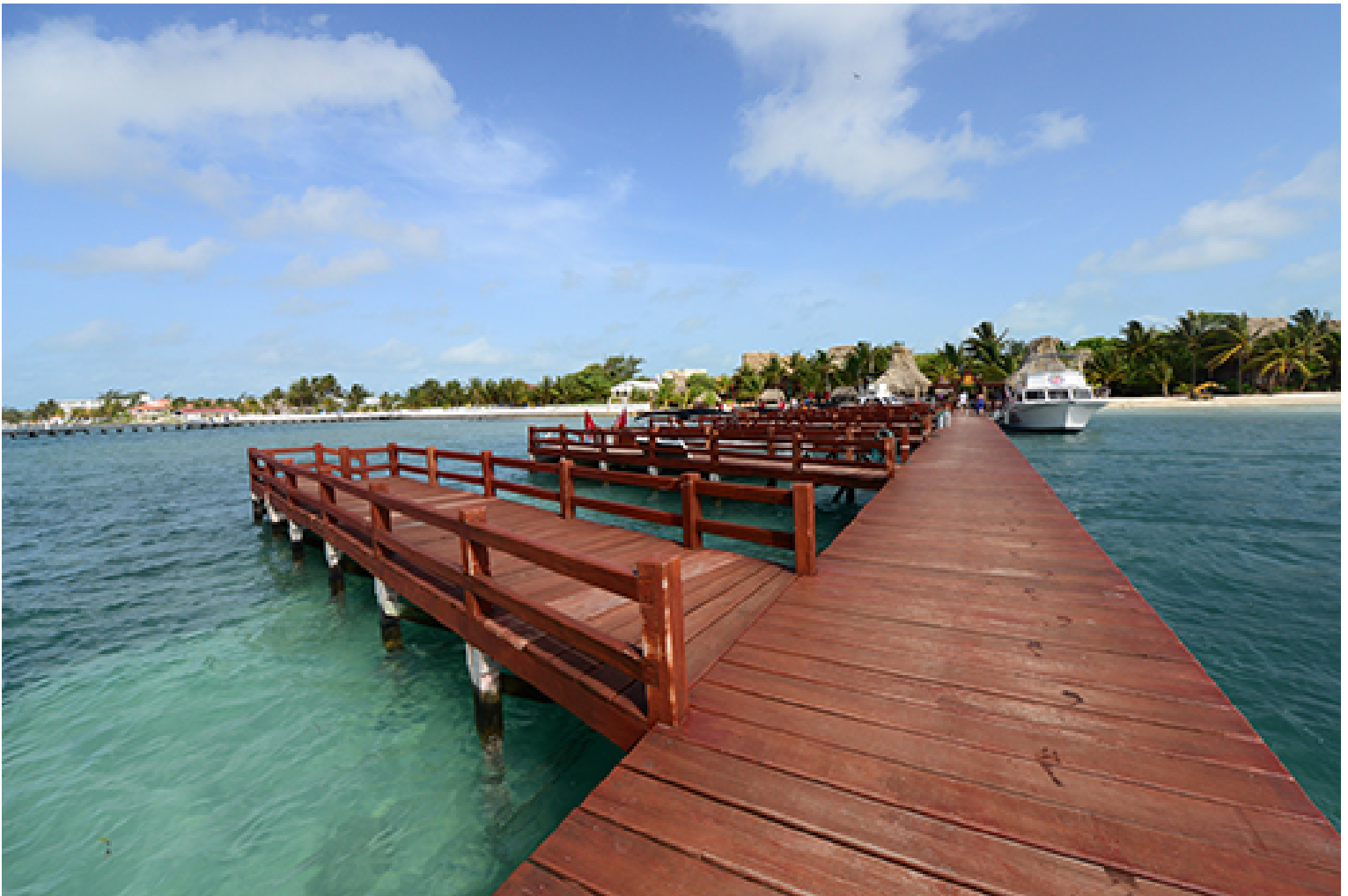
Enjoy the sunset in Ambergris Caye

Adjacent to the largest barrier reef in the Western hemisphere, Ambergris Caye is a popular place for diving and snorkeling. Ambergris Caye is Belize’s largest island (approximately 36 miles) and is also the best place for viewing the sunset with a sundowner. From the cobblestone streets of San Pedro to the beaches, visitors are almost guaranteed a picture-perfect sunset.