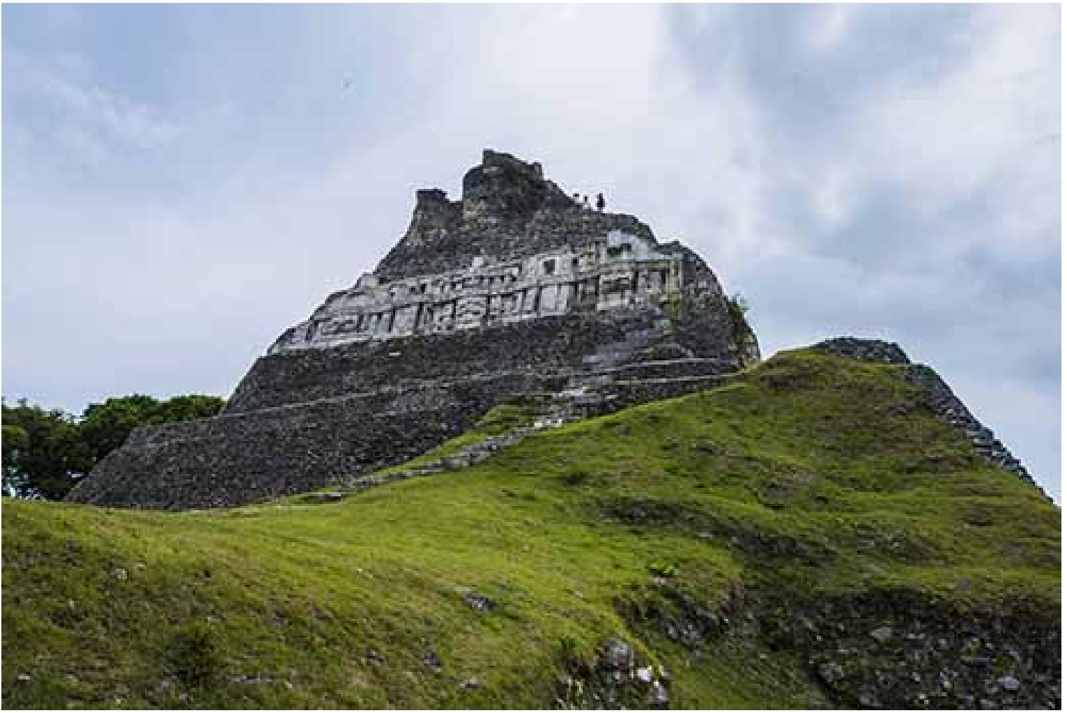
Xunantunich has Belize's most impressive Mayan ruins.

Once home to the Mayans, Belize is dotted with ancient ruins. One of the most popular and impressive ruins to visit is the hilltop Xunantunich ( http://www.nichbelize.org/ia-maya-sites/xunantunich.html ) ("maiden of the rock" in Mayan), near the Guatemalan border. Accessible by taking a hand-cranked ferry ride over the Mopan River, the ruins were built during the Classic period (200 A.D. – 900 A.D.). The ruins include six plazas, 25 temples and palaces including El Castillo (the Castle), the largest pyramid that towers 130 feet above the plaza and is adorned with elaborate friezes on the east and west sides.