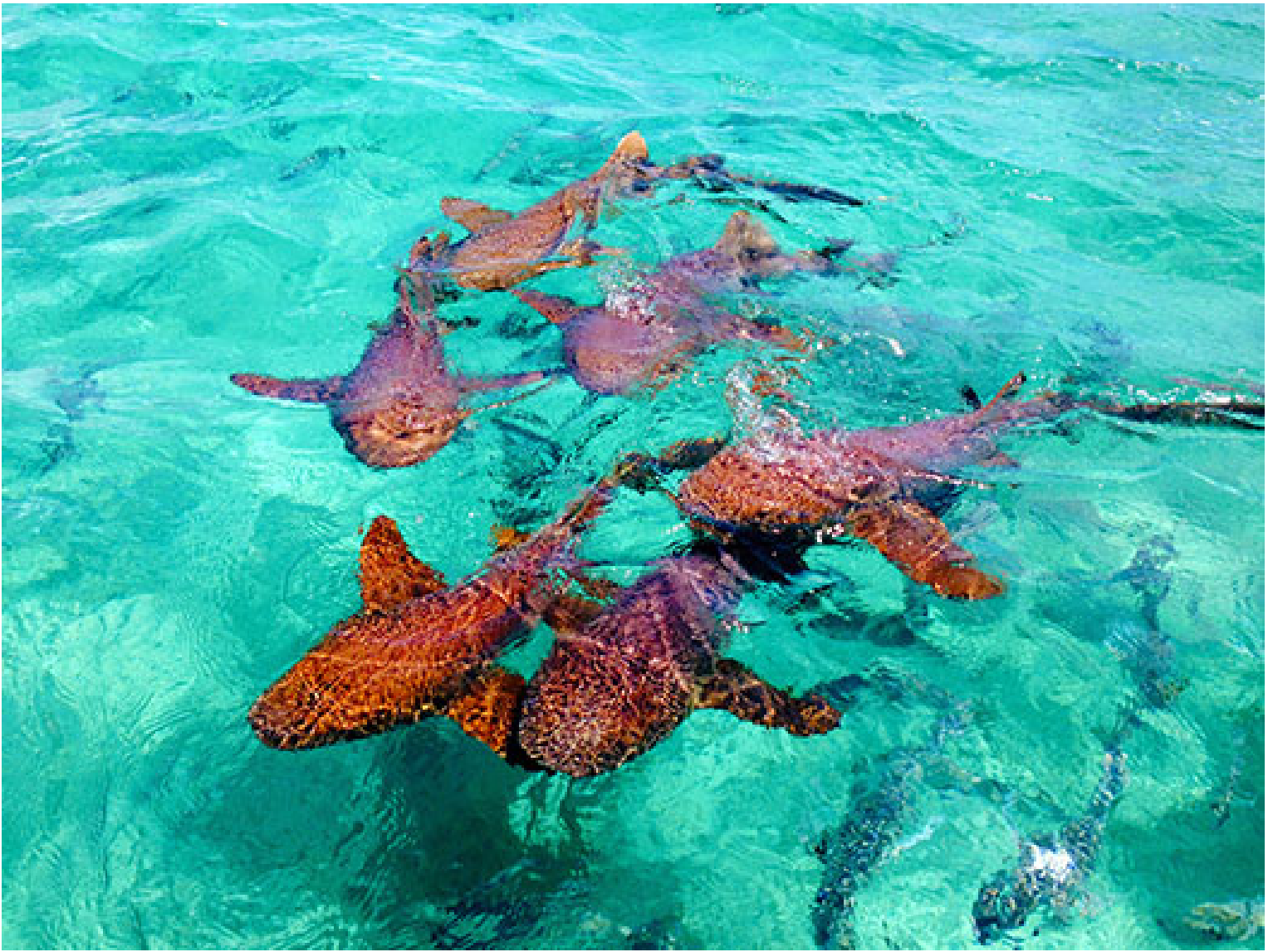
Snorkel with nurse sharks and stingrays.

Considered part of Hol Chan Marine Reserve ( http://www.holchanbelize.org/ ), Shark Ray Alley is located one mile south of the Hol Chan Cut and was once a place where fishermen would clean their catches, which attracted stingrays and nurse sharks. It's now a prime spot for snorkeling with stingrays, nurse sharks and turtles. Aquatic adventure seekers must visit via a boat and guide from San Pedro or Caye Caulker to visit Shark Ray Alley.