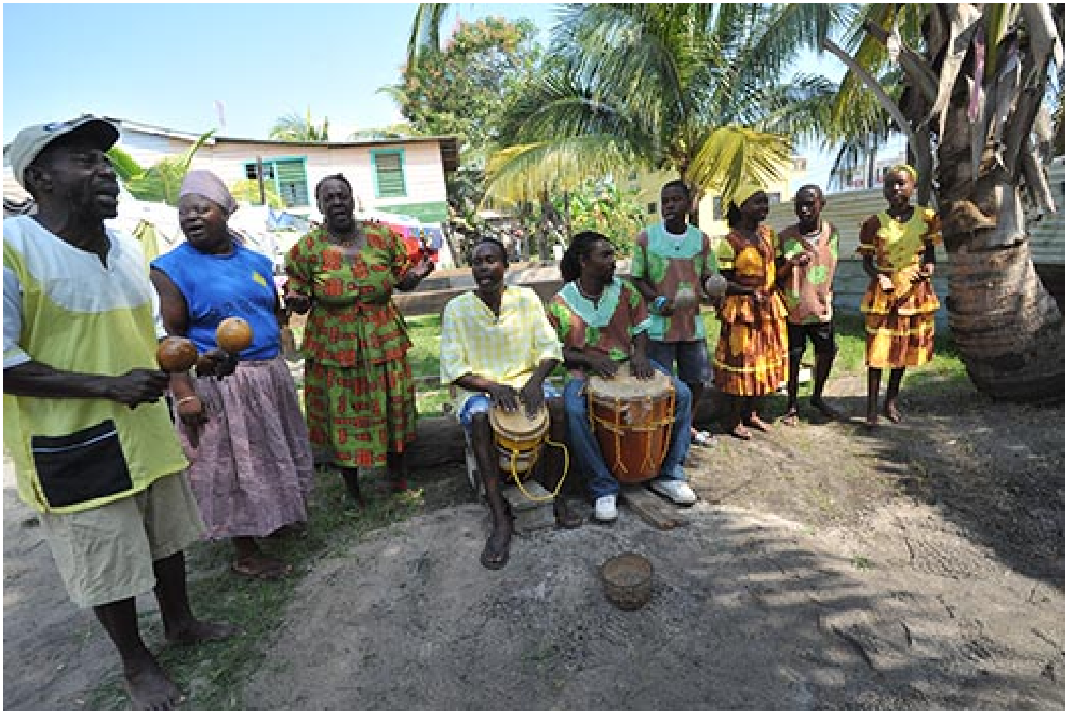
Drum, dance and dine Garifuna style

Hopkins, a coastal village in eastern Belize, is known as the cultural center of the Garifuna community. Descendants of West African, Central African, Carib and Arawak people, Garifuna culture thrives in Hopkins. Visitors are warmly welcome to dance, learn, drum and indulge in traditional cuisine like tamales and conch fritters.