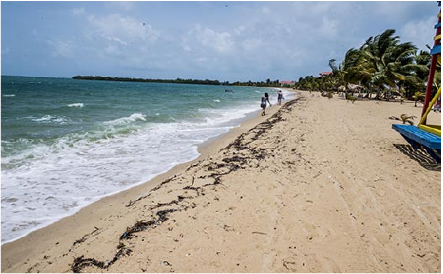
Enjoy Belikin Beer beachside.

One of the best spots to sip local Belikin Beer is Placencia Peninsula. Known locally as “Barefoot Perfect,” Placencia Peninsula is 16 miles of golden sand, the only golden-sand beaches on mainland Belize. After sunbathing on the beach, soak up the traditional Kriol (Creole) fishing village vibe over an ice cold Belikin lager or stout at local village bars and restaurants, or enjoy a bottle or two with your feet in the sand.