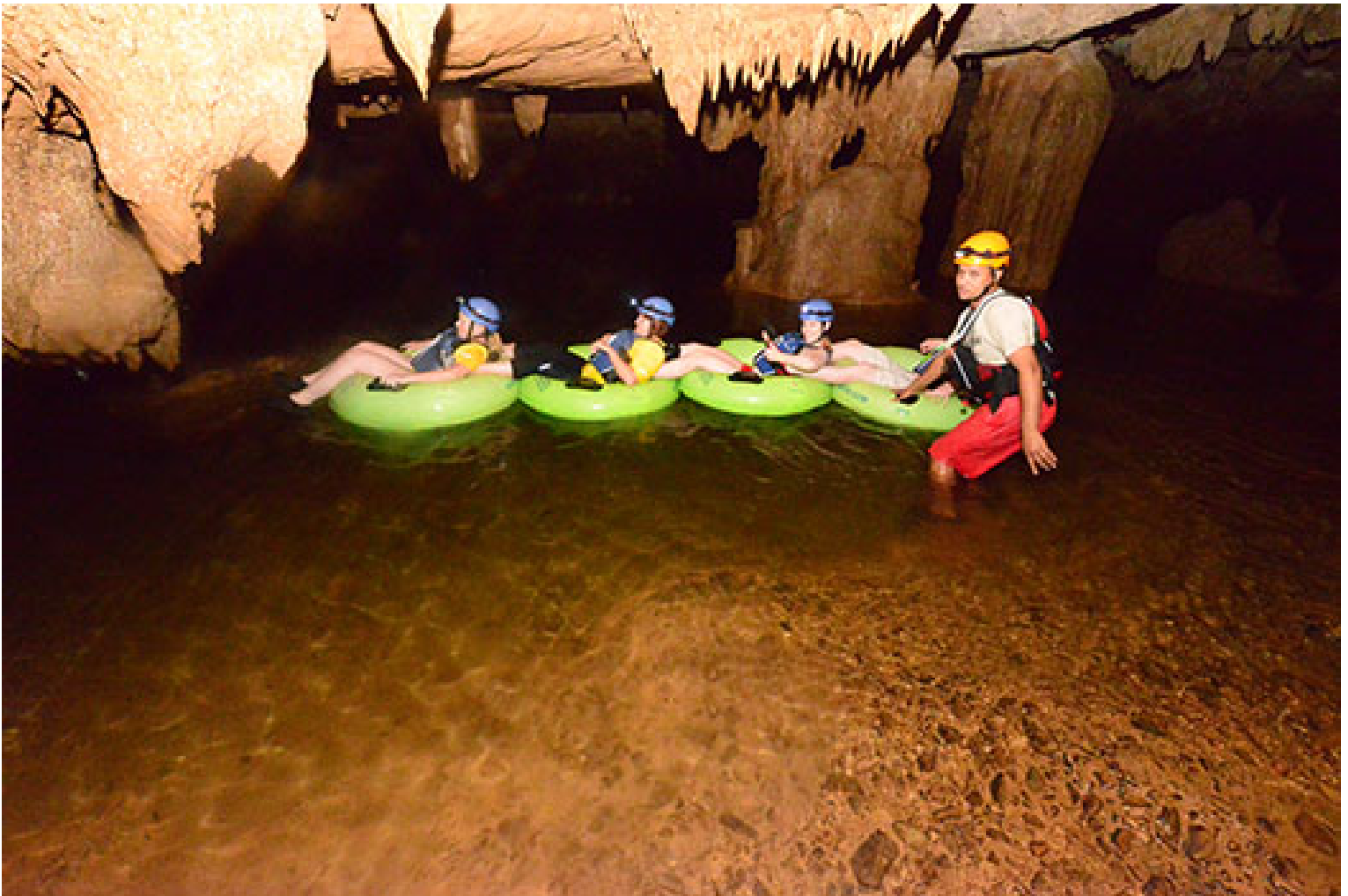
Cave tubing is fun for the entire family in Belize.

Grab an inner tube and float through the Caves Branch River east of the capital, Belmopan. The Nohoch Che'en Caves Branch Archaeological Reserve is home to caves the ancient Maya held sacred. Tubing tours take visitors into the caves populated with stalactites, stalagmites, Mayan cave paintings and aquatic life. Tours run daily, so stop, er , float by and don't forget your camera. Tour operators like Vital Nature and Mayan Tours ( http://cavetubing.bz/ ) offer cave tubing tours daily.