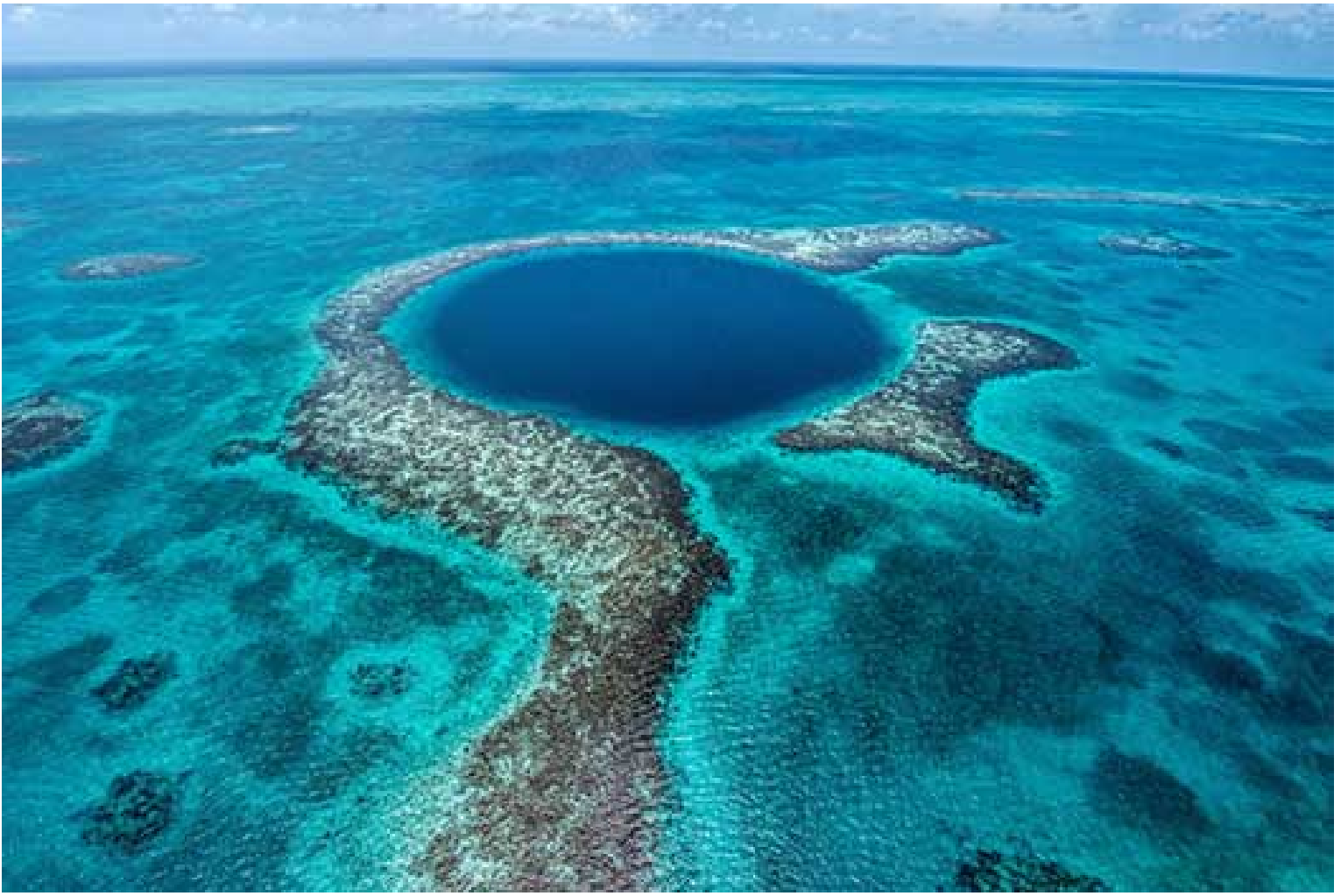
The Blue Hole is the largest formation of its kind.

Serious divers must experience The Blue Hole, a 1,000-foot across sinkhole that is home to diverse marine life like hammerhead sharks and expansive underwater vistas. Made famous by a 1970s Jacques Cousteau documentary, this is the world's largest formation of its kind. Located 55 miles east of Belize City ( https://www.cheapflights.com/flights-to-belize-city/ ), The Blue Hole is 412 feet deep, not for the faint of heart. Tour operators like Ramon's Village Dive Shop ( http://ramons.com/diveshop.cfm ), Splash Dive Center ( http://www.splashbelize.com/ ), Portofino ( http://portofinodiving.com/ ) and Seahorse Dive Shop ( http://belizescuba.com/ ) offer tours to The Blue Hole.