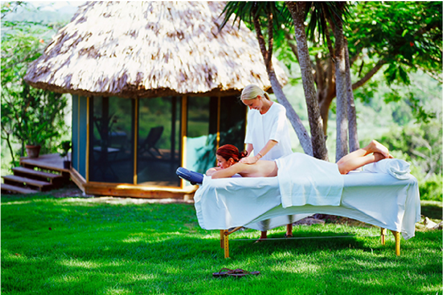
Relax al fresco at Chaa Creek. (Image: Chaa Creek ( http://www.chaacreek.com/ ))

Set within a 365-acre rain-forest reserve, Eco-resort Chaa Creek ( http://www.chaacreek.com/ ) is bordered by the Macal River and Maya Mountains foothills. While the 23 thatched cottages provide luxurious and relaxing accommodations, the Hilltop Spa at Chaa Creek ( http://www.chaacreek.com/amenities/belize-spa ) makes this a destination worth seeking out. The spa offers a range of massages, facials, manicures and pedicures with herbal and Eco-friendly products. Try the signature Chocolatissimo Spa Treatment, a soothing sensuous spa experience that includes a trio of cacao treatments, a scrub, a body wrap and 60-minute massage.