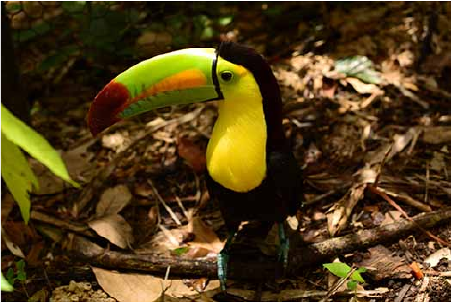
Colorful toucan

How does spending the night in the jungle sound? Located in the Bermudian Landing village in the Belize River Valley area, Howler Monkey Resort ( http://www.howlermonkeyresort.bz/ ) is a riverside lodge where travelers can get up close and personal with nature. There's a trail that traverses the 20-acre monkey sanctuary. The resort has six air-conditioned cabins located beneath the monkey's canopy, providing perfect photo opportunities.