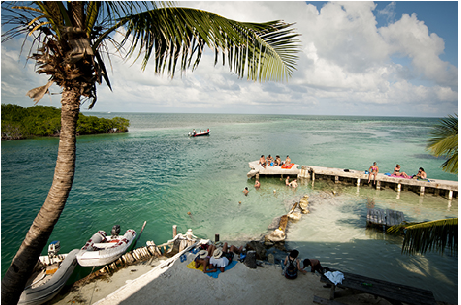
Caye Caulker boasts beautiful, uncrowded beaches

Leave the crowds behind and escape to Caye Caulker's quiet beaches. Home to some of the best SCUBA diving and snorkeling in Belize, Caye Caulker is an easy water taxi ride away. There are charming small shops, excellent seafood restaurants and idyllic beaches.