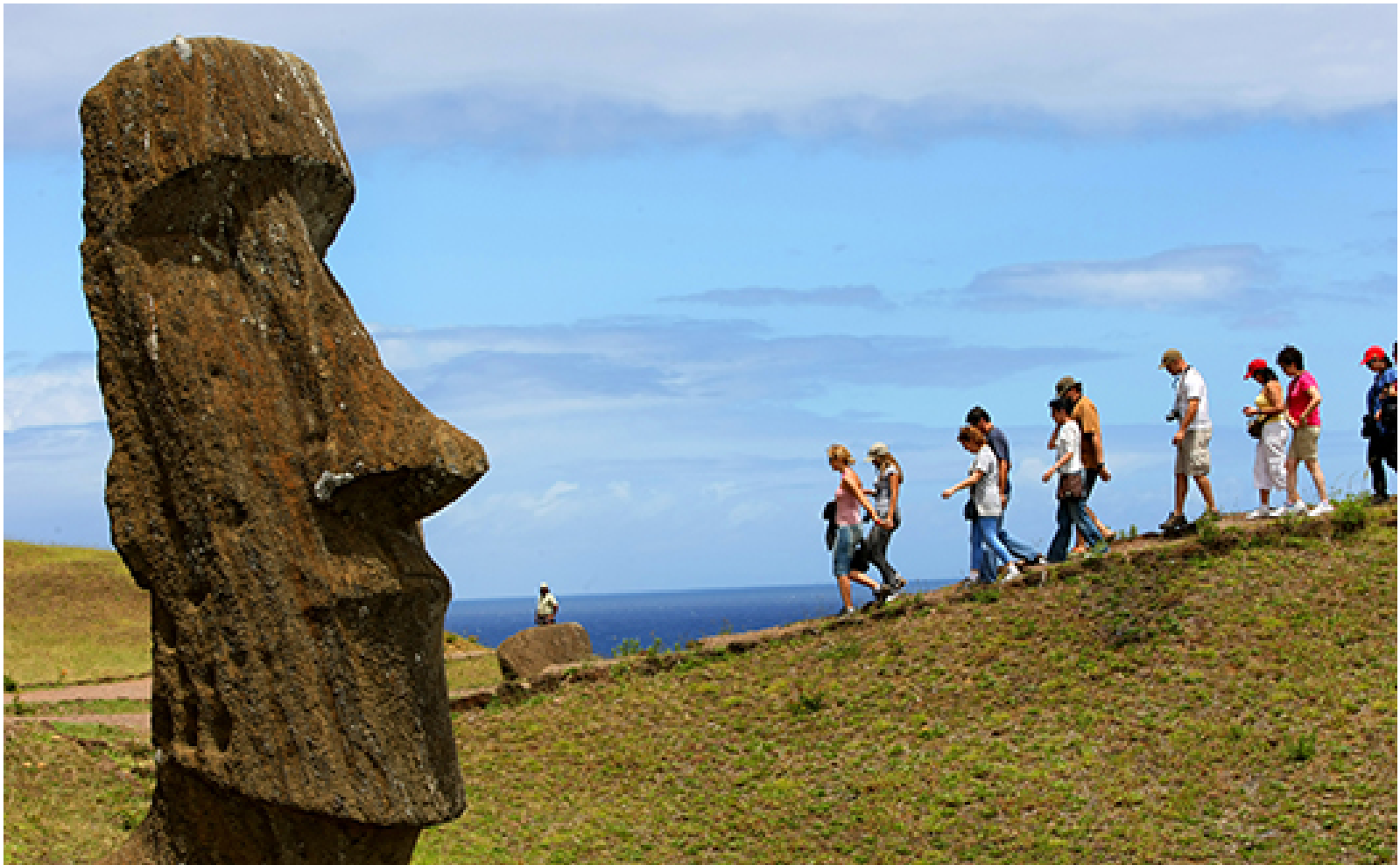
Easter Island

Famous for its monumental statues, Easter Island ( https://www.cheapflights.com/flights-to-easter-island/ ) is a remote island off the coast of Chile ( https://www.cheapflights.com/flights-to-chile/ ). After making the trek, travelers can get a free novelty stamp, an image of three moai (monolithic statues) at the post office.