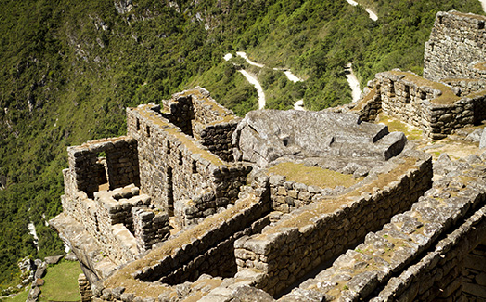
Machu Picchu

It’s not the easiest place to travel to, so getting a passport stamp from Antarctica ( https://www.cheapflights.com/flights-to-antarctica/ ) is highly sought after; only 37,405 folks traveled to Antarctica in the 2013-2014 season. Unless you are working at a scientific center, you will need to go on an official tour through the International Association of Antarctica Tour Operators ( http://iaato.org/home ). Most visitors travel to Antarctica from Ushuaia, Argentina or Punta Arenas ( https://www.cheapflights.com/flights-to-punta-arenas/ ), Chile (though limited trips depart from South Africa ( https://www.cheapflights.com/flights-to-south-africa/ ) and New Zealand ( https://www.cheapflights.com/flights-to-new-zealand/ )). Travelers to Antarctica must go with a tour operator and can either sail or fly, then board a ship to explore the peninsula. Antarctica is managed by more than 50 nations through the Antarctic Treaty System, so there are no official passport stamps. Tour operators can arrange to visit scientific stations in advance, and visitors can get souvenir stamps for their passports at these stations. There are also some historic sights like Port Lockroy (which is also a British post office) and Detaille Island, both managed by the UK Antarctic Heritage Trust, which also have souvenir stamps