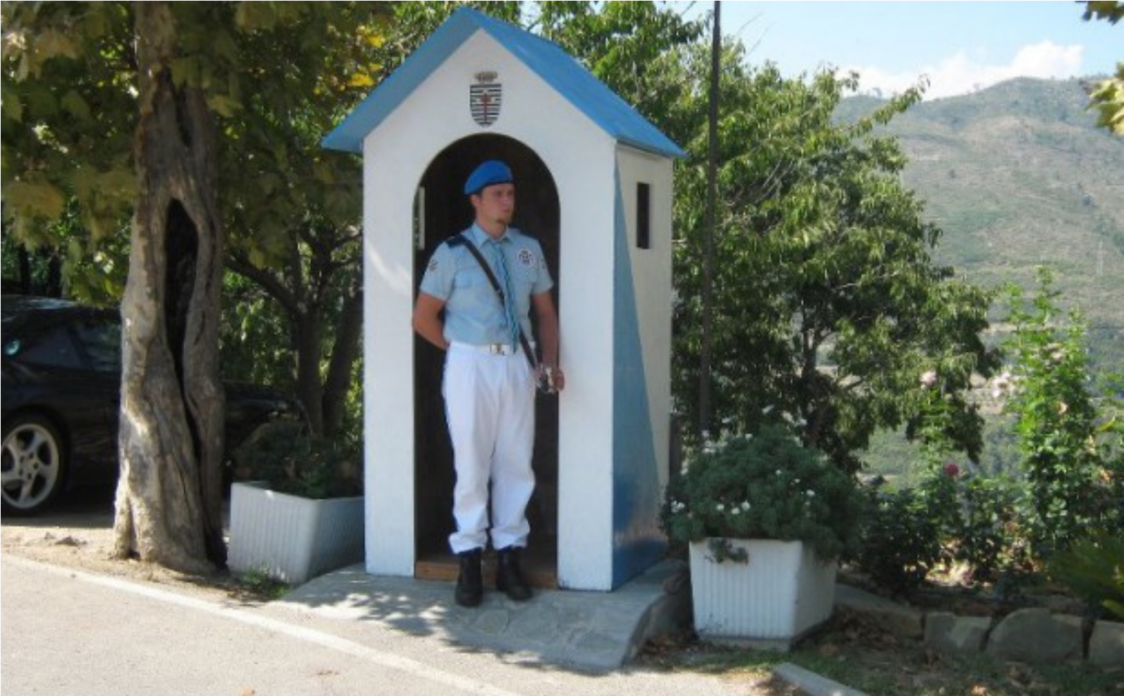
Principality of Seborga (Image: Principality of Seborga ( http://principalityofseborga.org/seborga_menu_UK.html ))