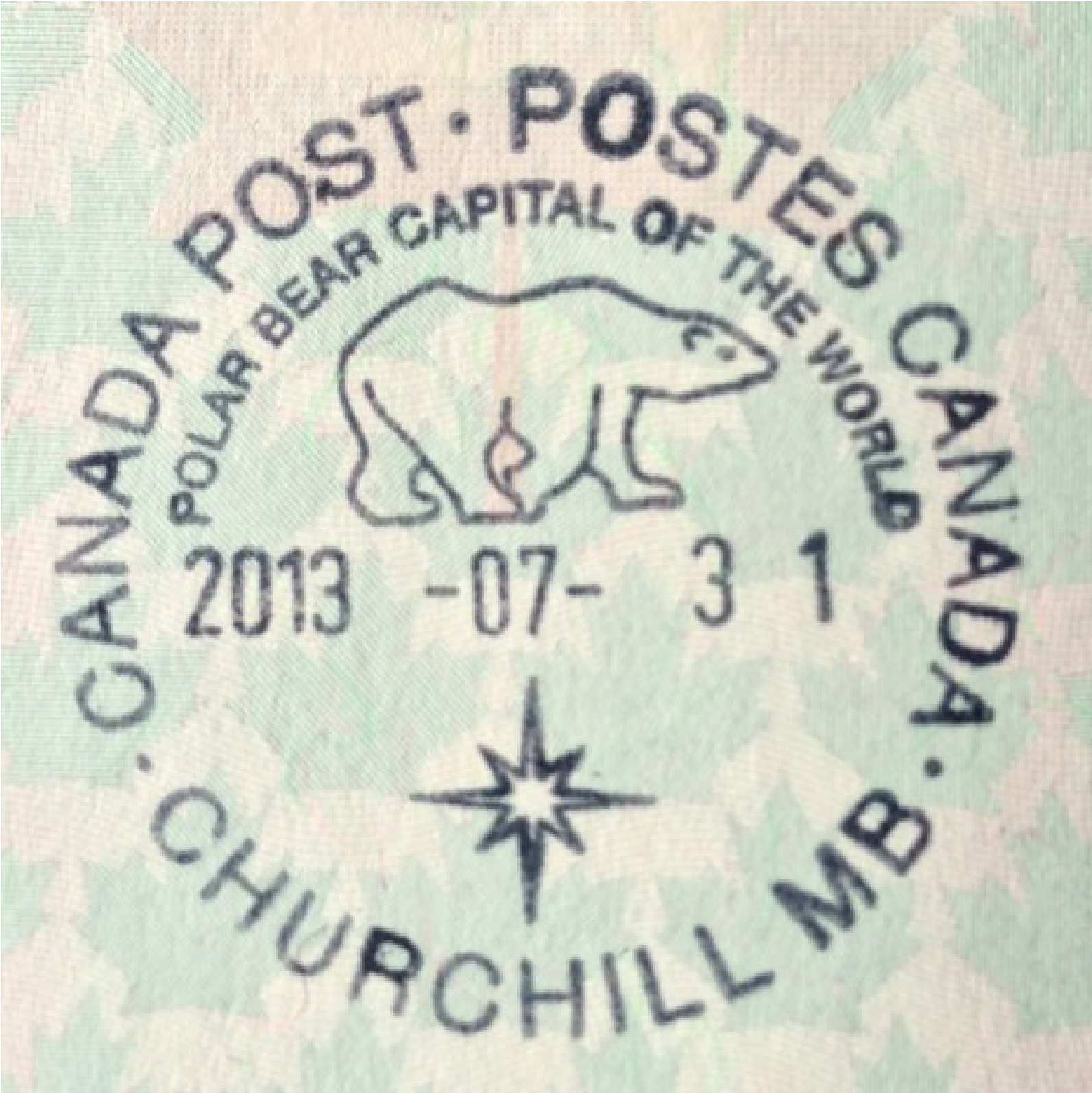
Passport stamp from Churchill, Manitoba, Canada