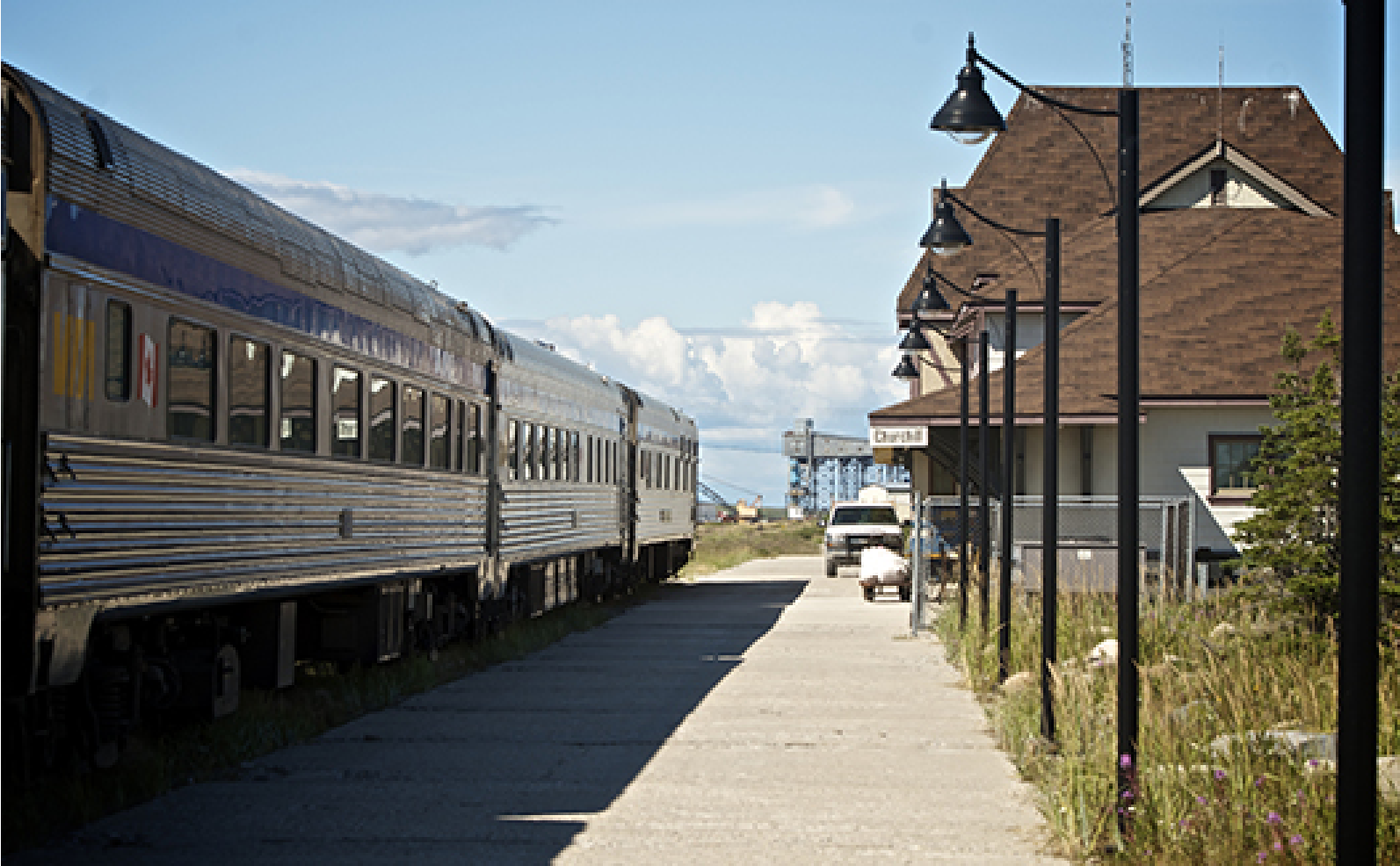
Churchill, Manitoba, Canada