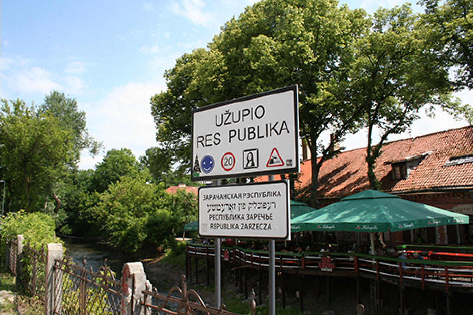
Užupis, Vilnius, Lithuania

Užupis ( http://www.vilnius-tourism.lt/en/tourism/vilnius-for-you/for-art-lovers/republic-of-uzupis/ ) is a small “republic” of artists in Lithuania’s capital Vilnius ( https://www.cheapflights.com/flights-to-vilnius/ ). Visitors can get a free souvenir stamp at the Užupis information center ( http://www.umi.lt/en/artists/uzupis-information-center/ ).