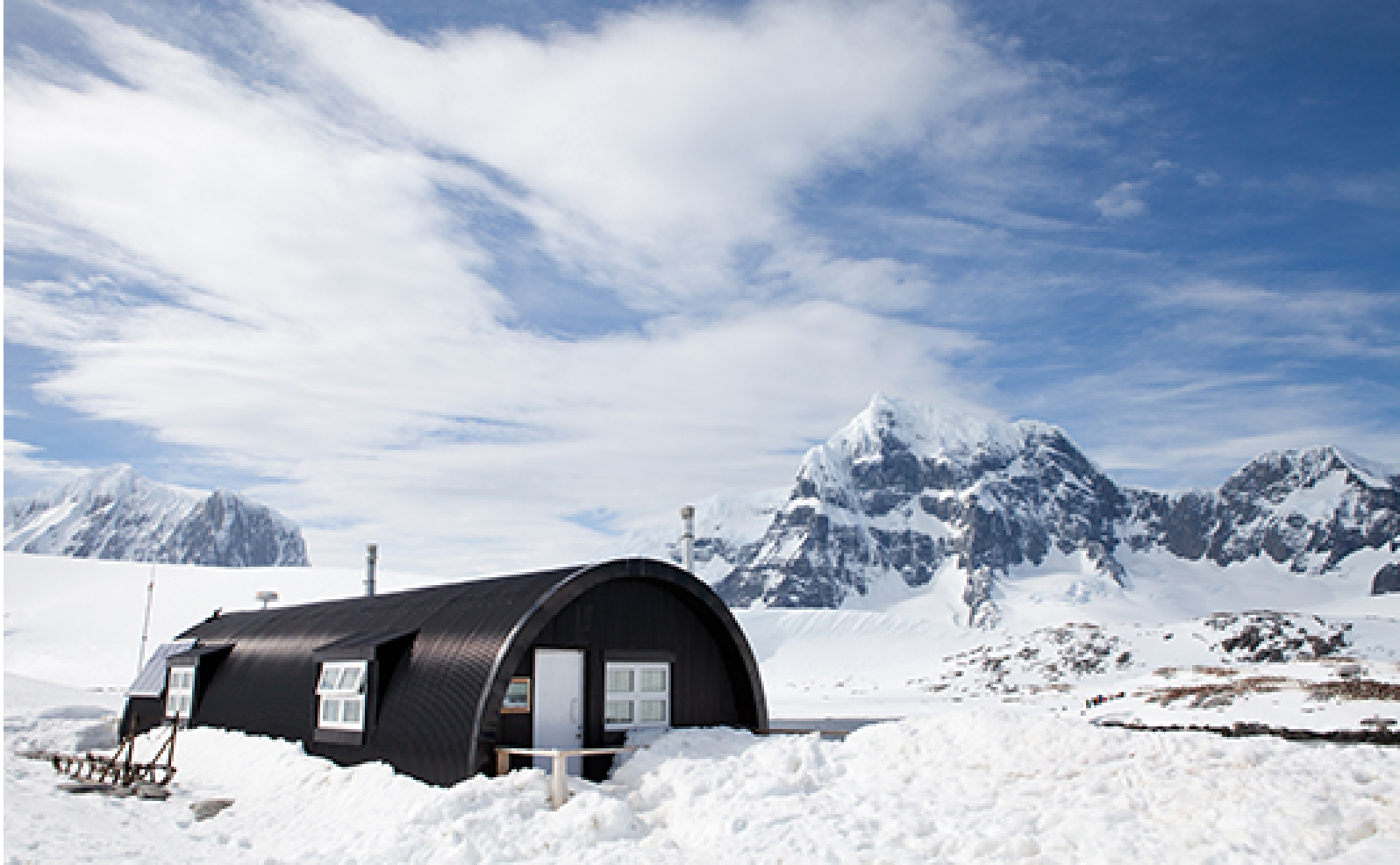
Port Lockroy, Antarctica