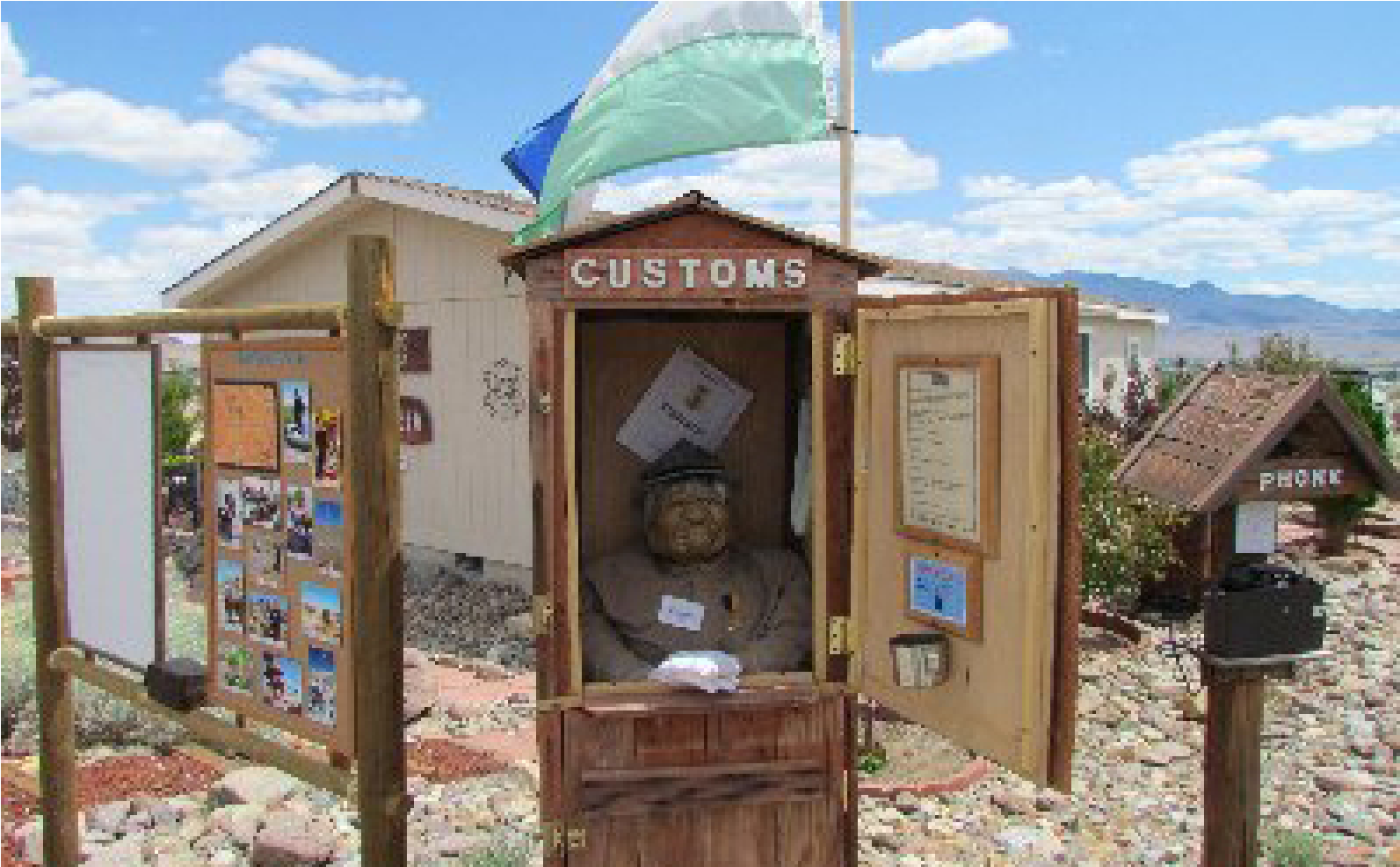
Customs Shack, Republic of Molossia

Checkpoint Charlie, the former Berlin Wall crossing between East Berlin and West Berlin during the Cold War, is now a tourist destination in Berlin ( https://www.cheapflights.com/flights-to-berlin/ ), Germany. Tourists can get a collection of souvenir passport stamps for a fee from “soldiers” affiliated with private companies.