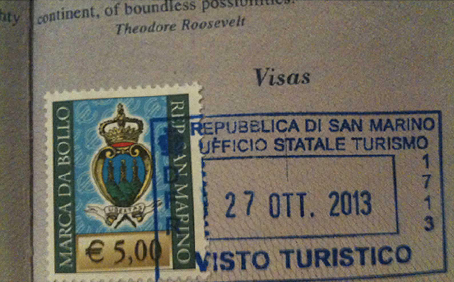
Passport stamp from the Republic of San Marino

Visitors to Lake Titicaca, Peru ( https://www.cheapflights.com/flights-to-peru/ ) can get a souvenir Uros passport stamp. The Uros are pre-Incan people who live on a number of floating islands on Lake Titicaca, a lake in the Andes on the border of Peru and Bolivia ( https://www.cheapflights.com/flights-to-bolivia/ ).