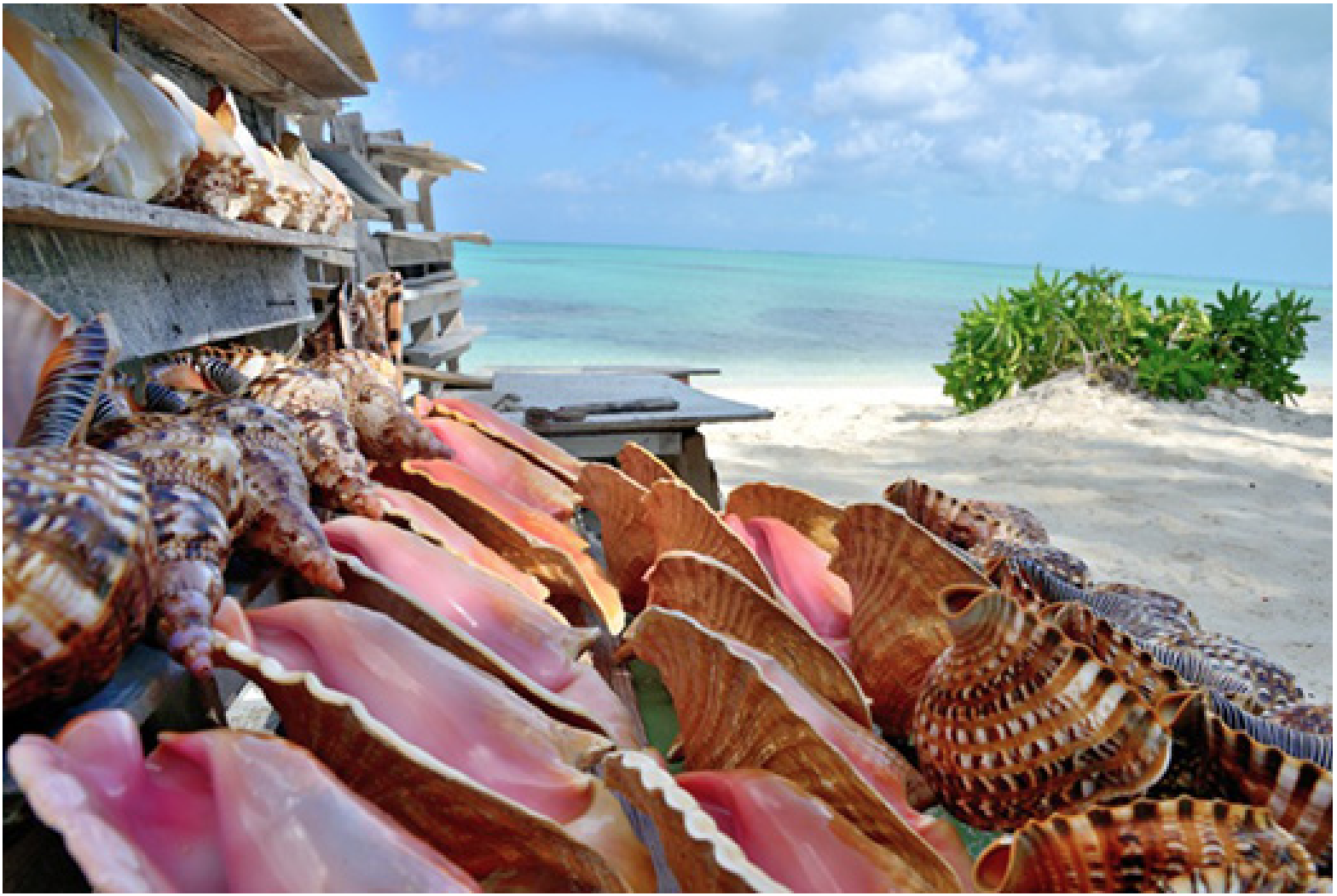
Turquoise waters await in the Turks & Caicos Islands.

Providenciales, the most developed island on the Turks & Caicos Islands ( http://www.cheapflights.com/flights-to-turks-and-caicos-islands/ ) features pristine white beaches and panoramic views of its famous turquoise water. The north shore of “Provo” has the best beaches including the 12-mile Grace Bay beach.