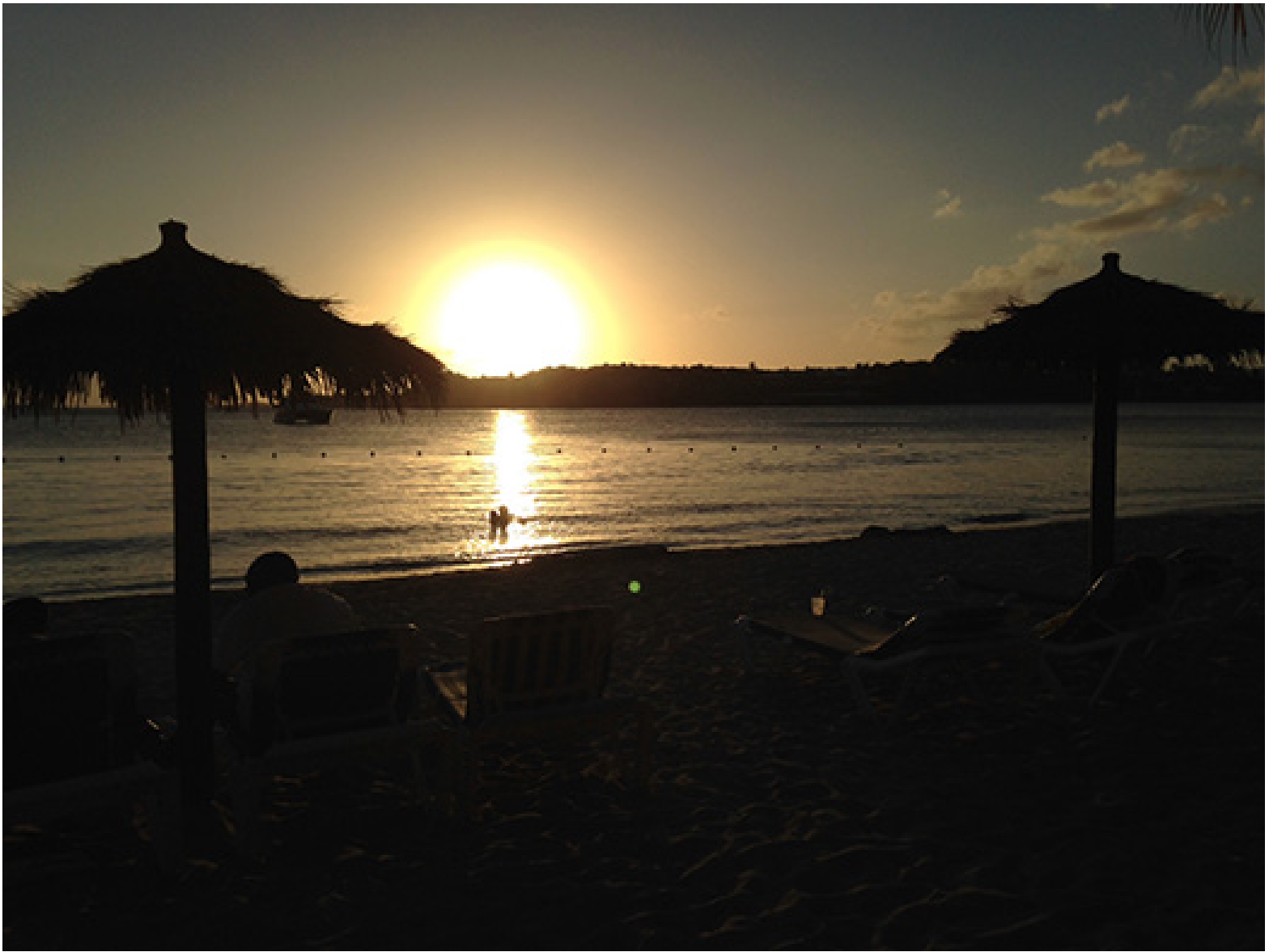
Emerald Bay is a gem in the United States Virgin Islands.

St. Thomas ( http://www.cheapflights.com/flights-to-st-thomas/ ) has more than 40 beaches that front crystal blue water. All beaches, including resort beaches like the petit Emerald Beach, are open to the public. Many include water sports like kayaking and windsurfing.