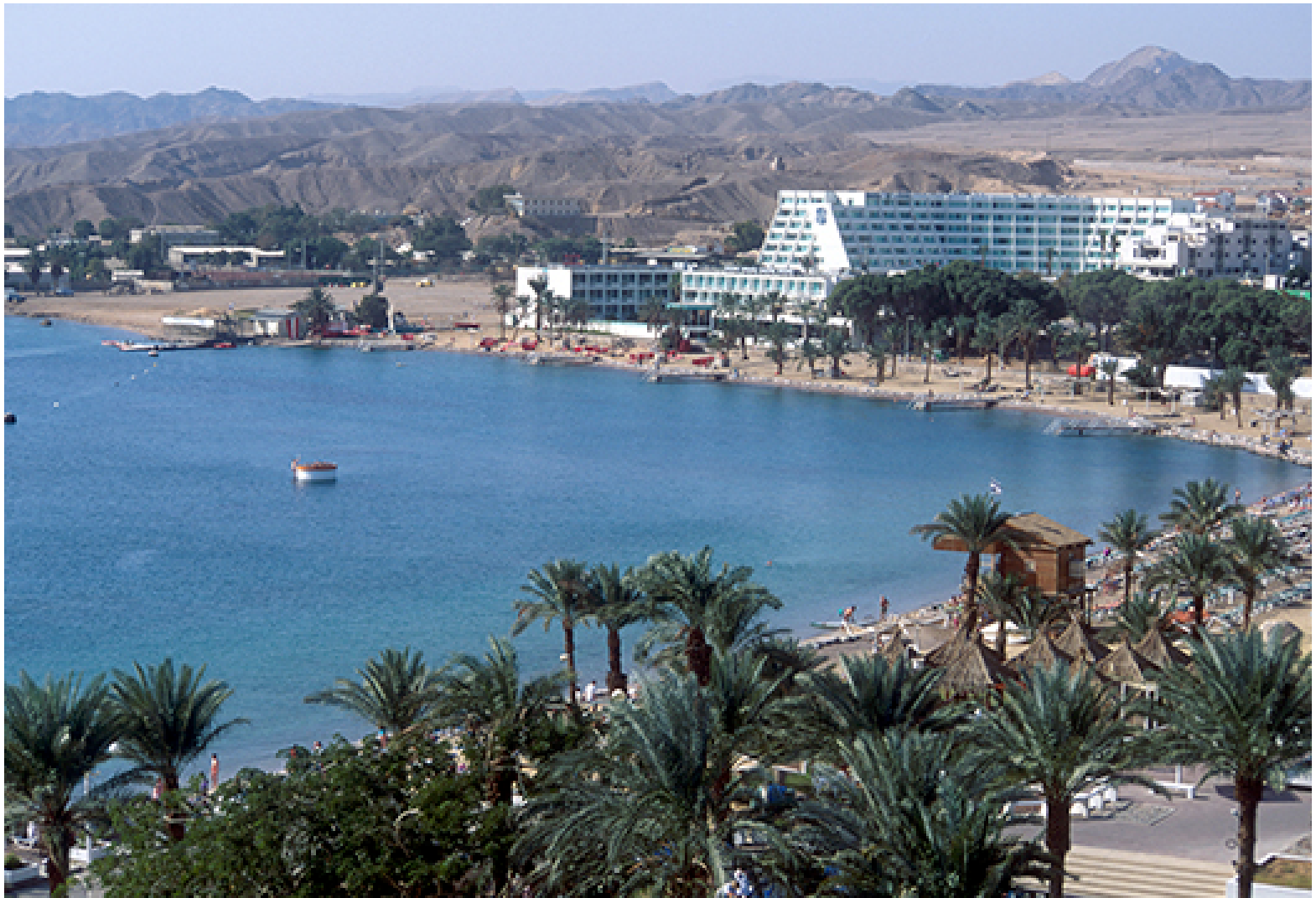
Cool off in Eilat Bay, Israel.

Fronting the Red Sea along the Jordanian border on the northeast and Egyptian border on the southwest are some of Israel ( http://www.cheapflights.com/flights-to-israel/ )'s – and the world's – best beaches. Even in the summer when temperatures surpass 100 degrees, the water in Eilat Bay remains in the cool 70s. The picturesque Eilat Mountains and desert add to the awesome ambiance.