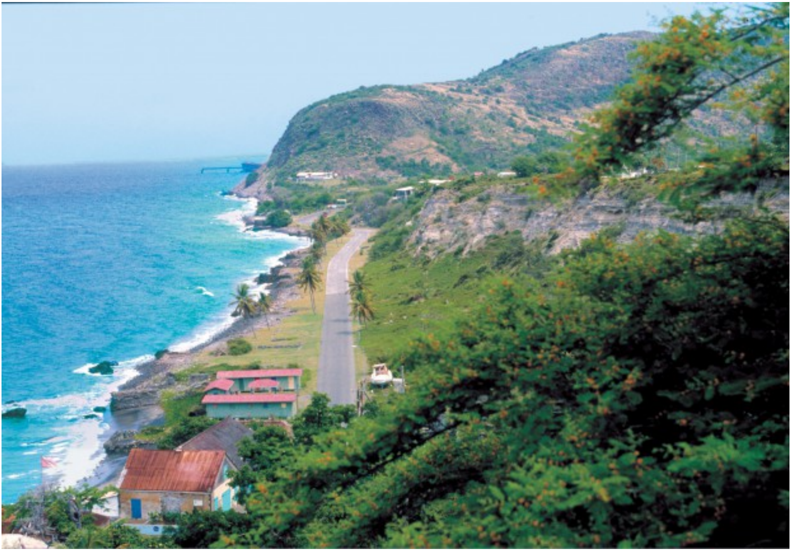
A trio of beaches populate St. Eustatius.

The northeastern Caribbean Dutch island has three beaches: the barren Oranje Bay; the black- and tan-sand Zeelandis Beach, whose heavy surf makes this a better option for sunbathing; and beige sand Lynch Beach, with shallow water ideal for wading and swimming.