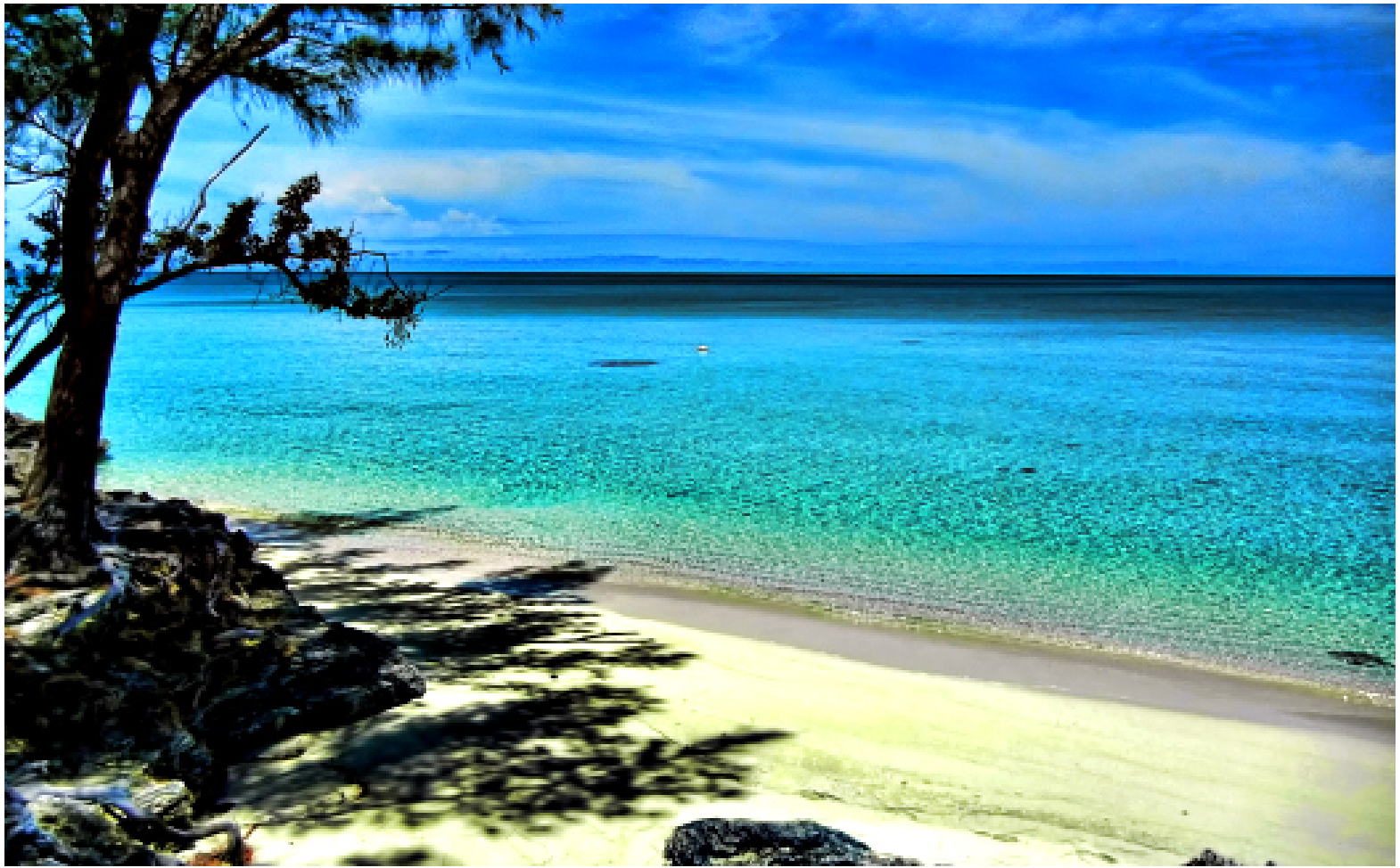
Beautiful beach in the Bahamas

With more than 2,000 islands and cays, there are plenty of beach options in the Bahamas ( http://www.cheapflights.com/flights-to-bahamas/ ). Pink and white sand beaches line the shores making picking where to sunbathe the toughest decision travelers have to make during their visits here.