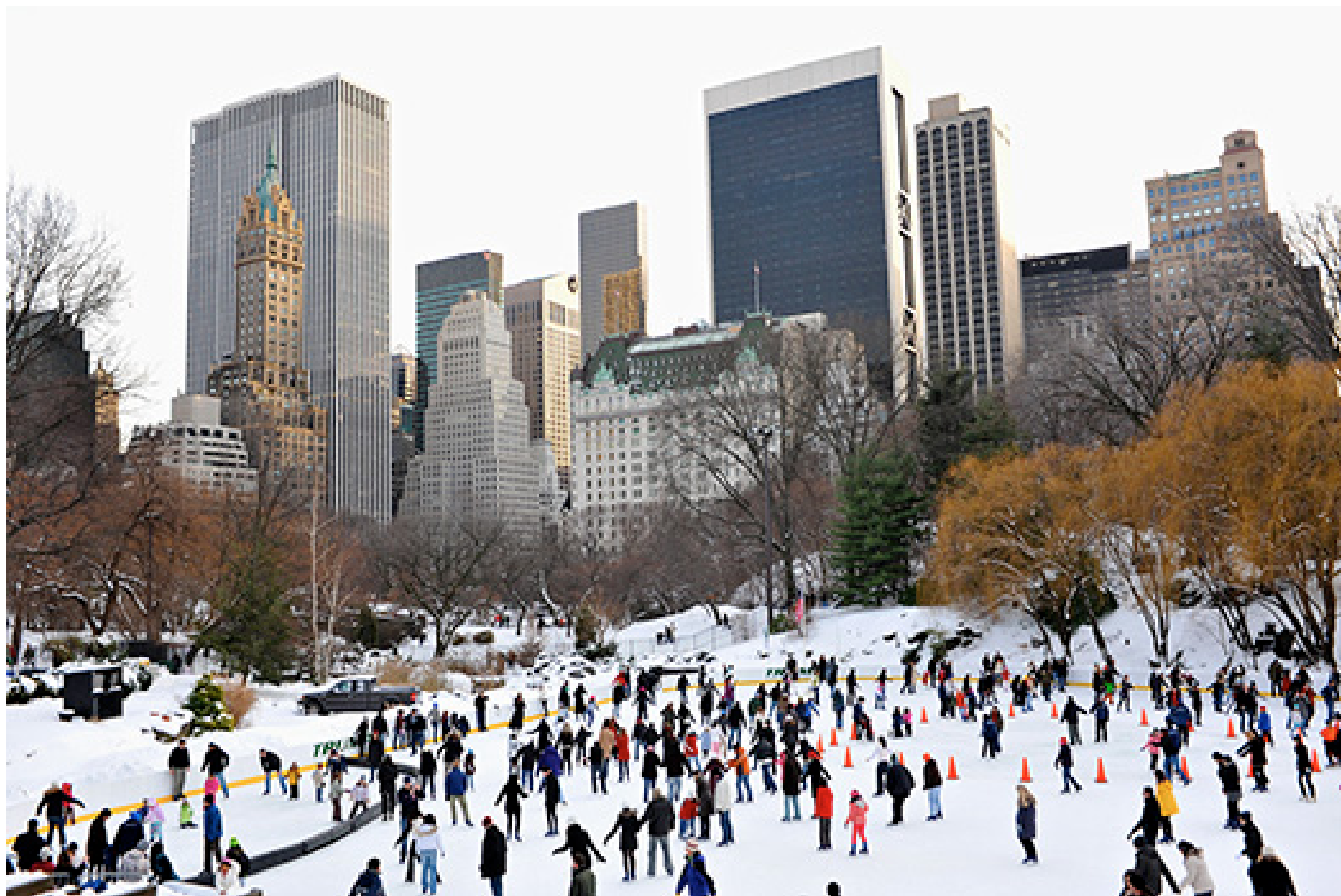
Enjoy Valentine’s Day on ice

Cuddling is what you’re guaranteed after a day of ice skating and sipping hot chocolate.