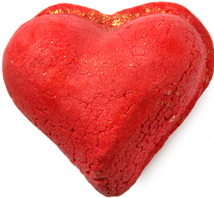
Heart Throb Bubbleroon

Spoil your sweetheart on V-Day with a spa day. While any day is ideal for a spa day, there are sweet deals at many spas this time of year. What's better than a spa day? At home spa treatments performed by your valentine!